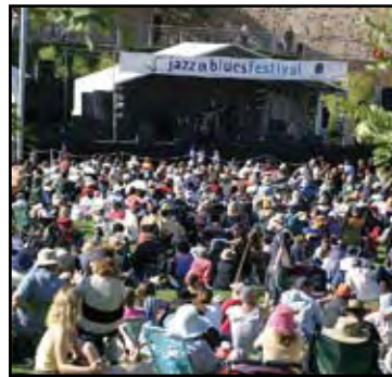
LEFT: The Jazz and Blues Festival was a major fundraising event in the early 2000s