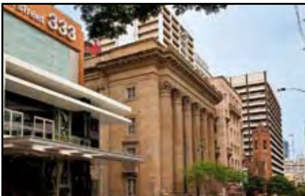
ABOVE: The Association's first AGM was held at Shell House in Ann Street, Brisbane. It is now the Rothbury Hotel.