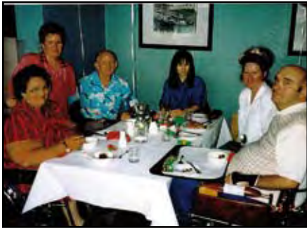
ABOVE LEFT: Members celebrate Christmas circa 1993