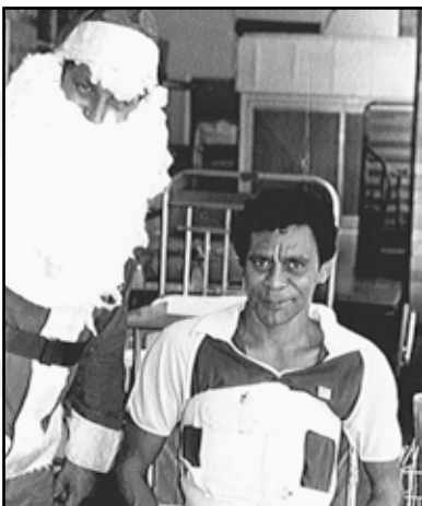
Santa visits the Spinal Injuries Unit in 1985

Paraplegics Welfare Association becomes the Paraplegic and Quadriplegic Association of Queensland